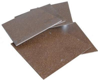
Unmounted Cork Liners