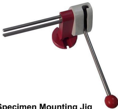
Specimen Mounting Jig