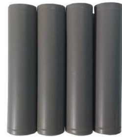
Standard Pilling Tubes